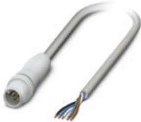
Sensor/Actuator cable, 5-position, PP-EPDM halogen-free, Gray RAL 7035, Plug straight M12, A-coded, on Free cable end, Cable length: 1.5 m, Hygienic design, with plastic knurl

Please be informed that the data shown in this PDF Document is generated from our Online Catalog. Please find the complete data in the user's documentation. Our General Terms of Use for Downloads are valid ( http://download.phoenixcontact.com )